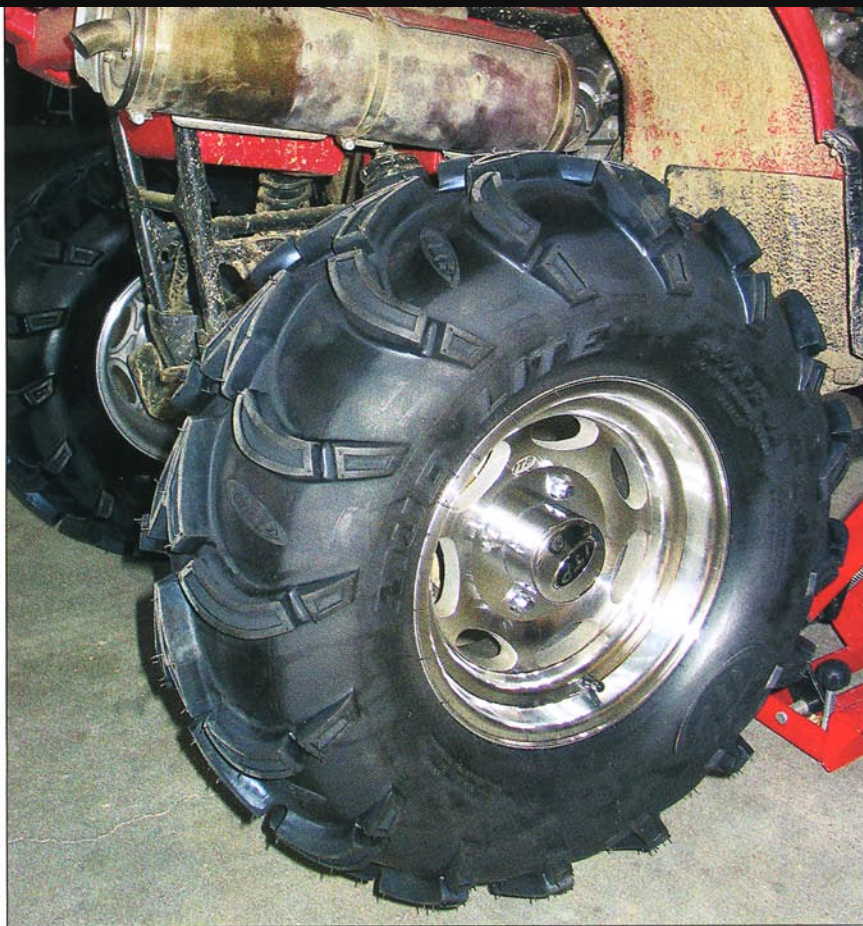
Complementing the new Mud Lite XL's are ITP's newest C-series one-piece aluminum rims ($79.95). These tires and wheels are a potent combination in the mud.